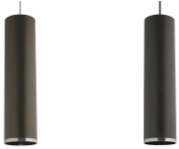
brown chestnut weathered gray oak