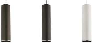
brown chestnut weathered gray oak white ash