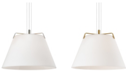
polished nickel / white