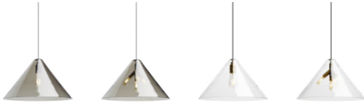
transparent smoke transparent smoke quatnik