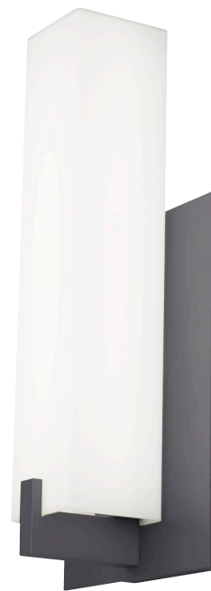
COSMO 18 shown in charcoal