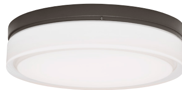
CIRQUE LARGE shown in bronze

* Visit techlighting.com for specific warranty limitations and details.