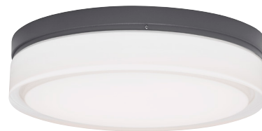
CIRQUE LARGE shown in charcoal