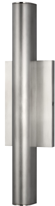
CHARA 17 WALL shown in satin nickel