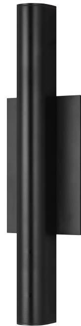
CHARA 17 WALL shown in black

* Visit techlighting.com for specific warranty limitations and details.