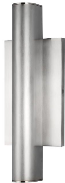
CHARA 12 WALL shown in satin nickel