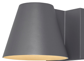
BOWMAN 6 shown in charcoal