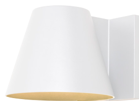
BOWMAN 6 shown in white