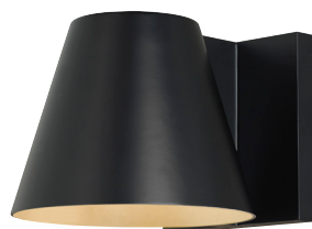
BOWMAN 6 shown in black

* Visit techlighting.com for specific warranty limitations and details.