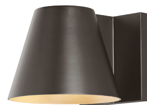
BOWMAN 6 shown in bronze