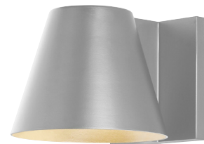
BOWMAN 6 shown in silver