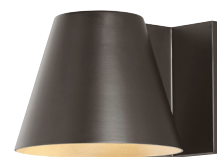
BOWMAN 4 shown in bronze