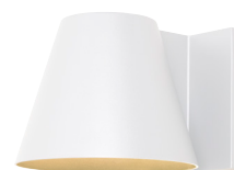
BOWMAN 4 shown in white