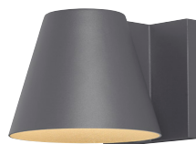
BOWMAN 4 shown in charcoal