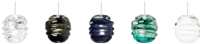
clear smoke steel blue surf green white