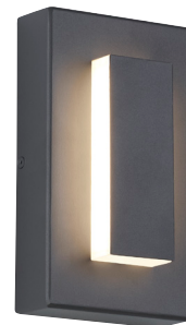
ASPEN 8 shown in charcoal

* Visit techlighting.com for specific warranty limitations and details.