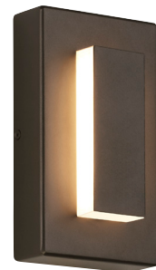
ASPEN 8 shown in bronze