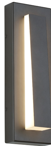
ASPEN 15 shown in charcoal

* Visit techlighting.com for specific warranty limitations and details.