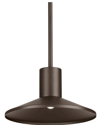
ASH PENDANT shown in bronze/clear lens