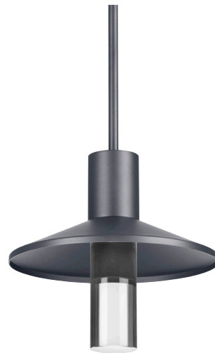
ASH PENDANT shown in charcoal/clear cylinder

* Visit techlighting.com for specific warranty limitations and details.