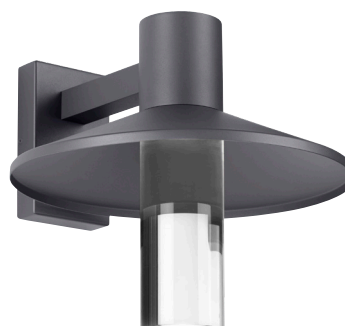
ASH 16 shown in charcoal/clear cylinder

* Visit techlighting.com for specific warranty limitations and details.