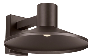
ASH 16 shown in bronze/clear lens