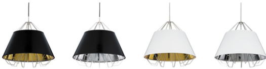
gloss black / gold shade