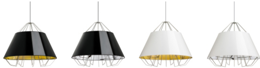
gloss black-gold shade gloss black-silver shade gloss white-gold shade gloss white-silver shade