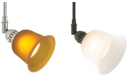
hurricane amber hurricane frost stained nickel antique finish