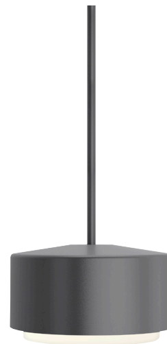
ROTON 12 PENDANT shown in charcoal

* Visit techlighting.com for specific warranty limitations and details.