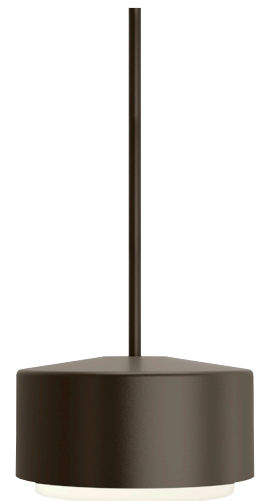
ROTON 12 PENDANT shown in bronze